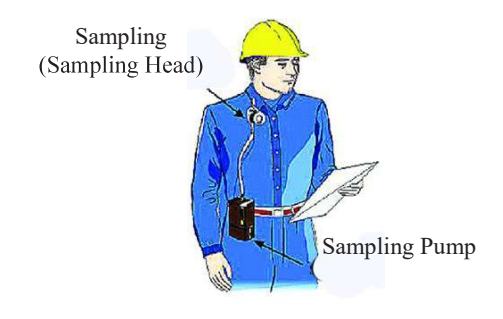
Figure 1. Personal dust sampler